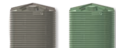
Slate Grey (Woodland Grey) Rivergum (Wilderness)