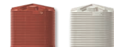
Heritage Red (Manor Red) Merino (Paperbark)