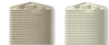
Beige Smooth Cream (Classic Cream)