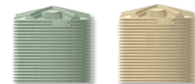
Mist Green (Pale Eucalypt) Wheat (Harvest)