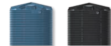
Torris Blue Black (Night Sky)

Optional COLORBOND® colours are available but may be subject to surcharge and/or delivery delay. Due to printing differences, some colours may vary. COLORBOND® and colour names are registered trademarks of Blue Scope Steel Ltd.™ Colour names are trademarks of Blue Scope Steel Ltd. Rapid Plastics colours represented match COLORBOND® steel colours.