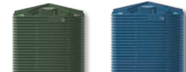
Heritage Green (Cottage Green) Mountain Blue (Deep Ocean)